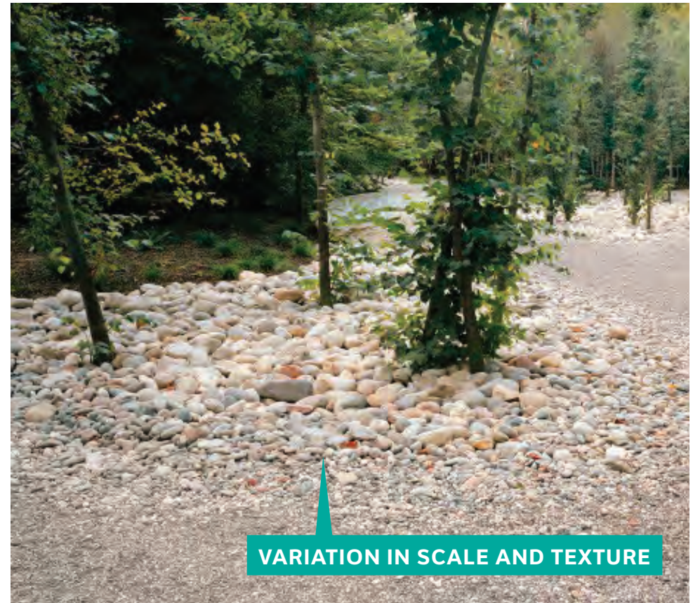
VARIATION IN SCALE AND TEXTURE