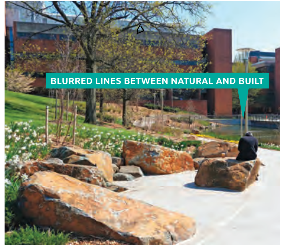
BLURRED LINES BETWEEN NATURAL AND BUILT